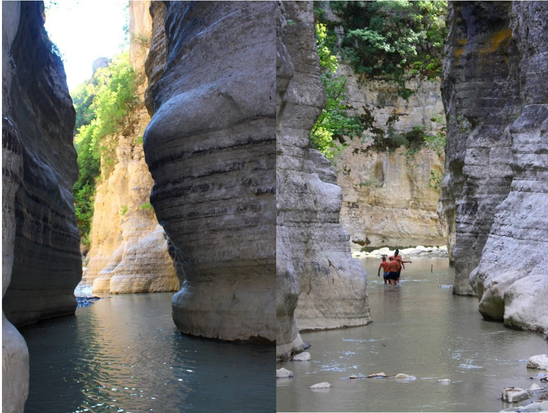
Fig. 2 Lëngarica canyon