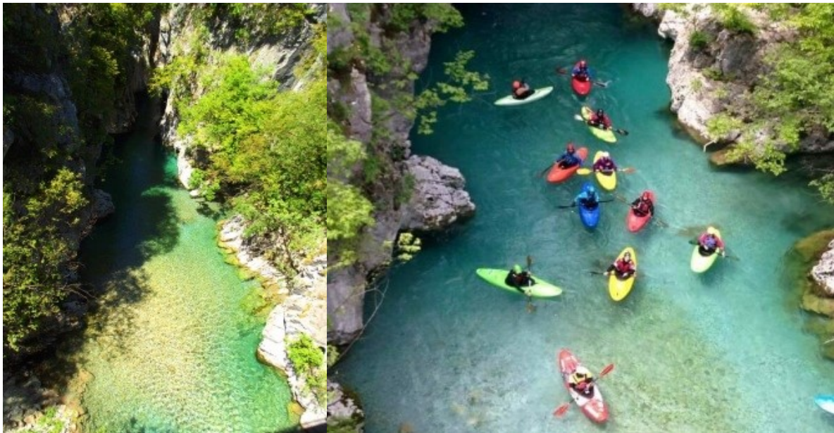
Fig. 3 Shoshani canyon