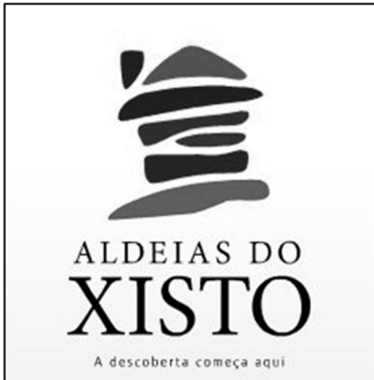
Fig. 3 Schist Villages Logo, Portugal

those willing to learn more about their place in our dynamic earth. Stones and rocks are known as man's first weapon against the difficulties and perils of their environment and helped man step onto the road to civilization (Paleolithic era). Therefore, stones and rocks were the first settlement of cavemen. Stone has had a certain divinity for human beings and created a variety of beliefs throughout history (Fadaei Tehrani, 2010). It can be said that stone and rocks are interwoven with human culture. There are many villages around the world which are built with stone or located/dug in rocks. As is well known, the geological processes