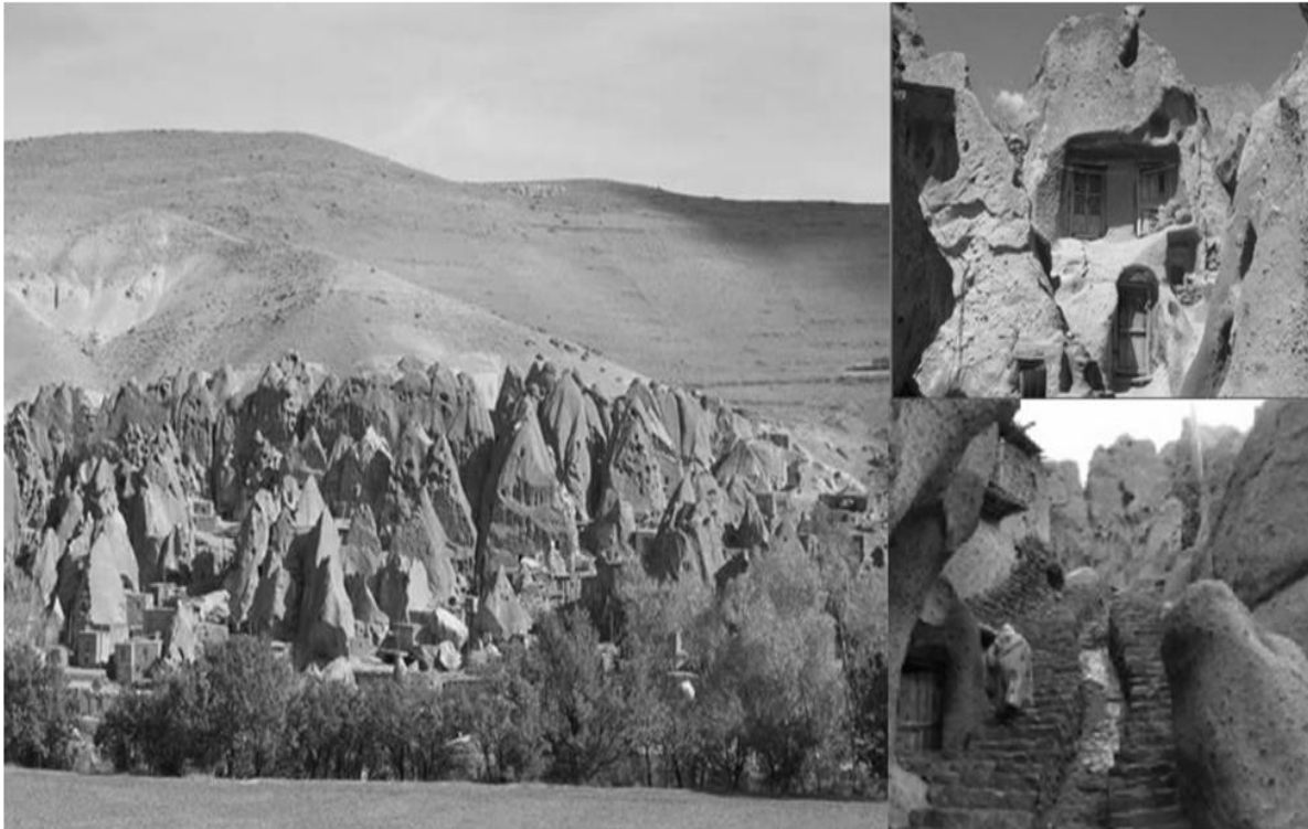
Fig. 2 Kandovan Rocky Village, Iran