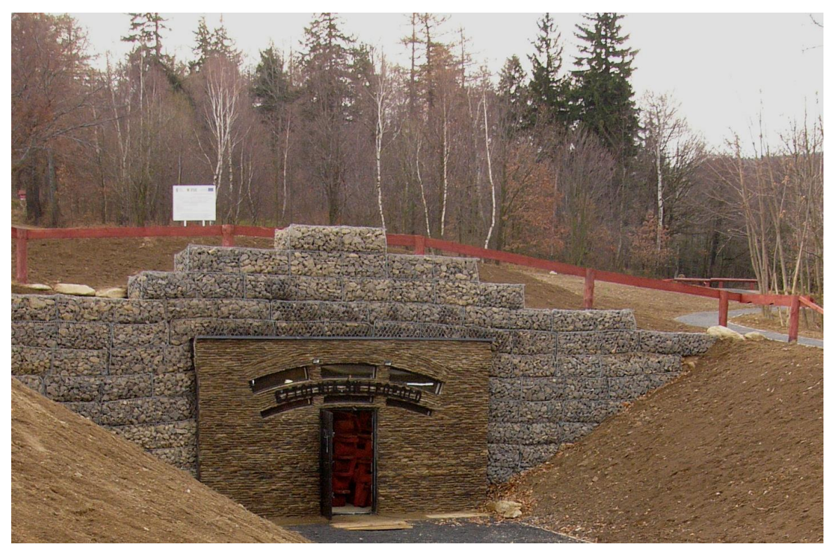
Fig. 4 The entrance to the exhibition pavilion and underground track "St. Johannes" Mine in Krobica.

The visiting of the complex of adits goes on with the well-educated guide. There are also some plans for demonstrations of 19^{th} century miners works. The underground part of the track leads by "St. Leopold" adit (18^{th}-19^{th} centuries), then by the sloping small shaft to the level of "St. Johannes" adit (16^{th}-18^{th} centuries) about 10 m above. The exit of this adit is located adjacent to the Krobica Stream and "St. Johannes" shaft, which fulfills the ventilation function for the whole underground route.