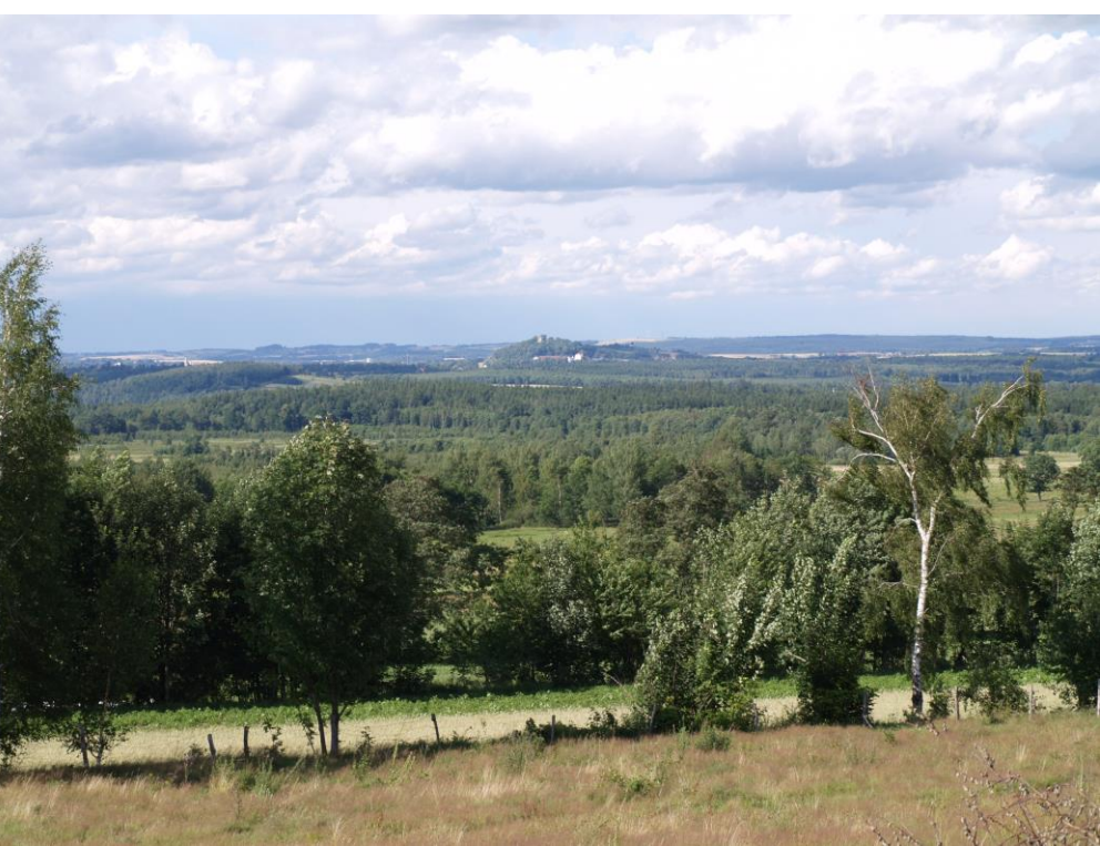
Fig. 2 The area of the tourist route "By the traces of the former ore mining".

- By the traces of the former ore mining". The direct purpose of the project of establishing the mentioned geotourist route has been related to the reclamation of territories degraded by former mining activities within the area of the Mirsk Commune, among the indirect ones have been the environmental, recreational and holiday purposes, cognitive and educational and scientific purposes, as well as the elimination of dangers resulting from wrong excavation closure and from the existence of post-exploitation vacuums, enhancing the tourist attractiveness of the region, protection of the cultural heritage of the area and its social and economic development (Feasibility Study, 2009).