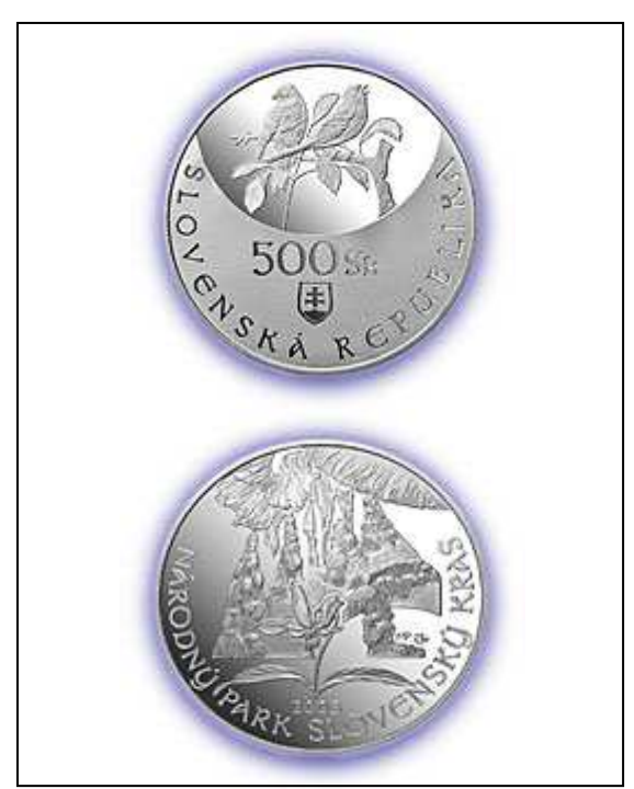
Fig. 6 Obverse and reverse of the Slovak Karst NP silver commemorative coin

Poldaufová. Coin producer is Bižutérie Czech Mint in Jablonec nad Nisou, gravers of this coin are Libuše Franckeová and Ivan Eyman. Basic parameters of coin are as follows: weight 33,63 g, diameter 40 mm, material Ag 925/1000 Cu 75/1000.