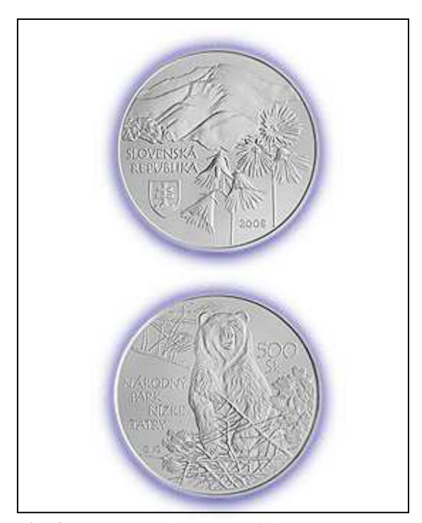
Fig. 8 Obverse and reverse of the Low Tatra NP silver commemorative coin

Silver collectors' (numismatic) coin with denomination of 20 € devoted to nature and landscape protection - Veľká Fatra NP was minted by NBS in 2009 (see Fig. 9).