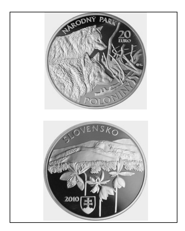
Fig. 10 Obverse and reverse of the Poloniny NP silver collectors' coin