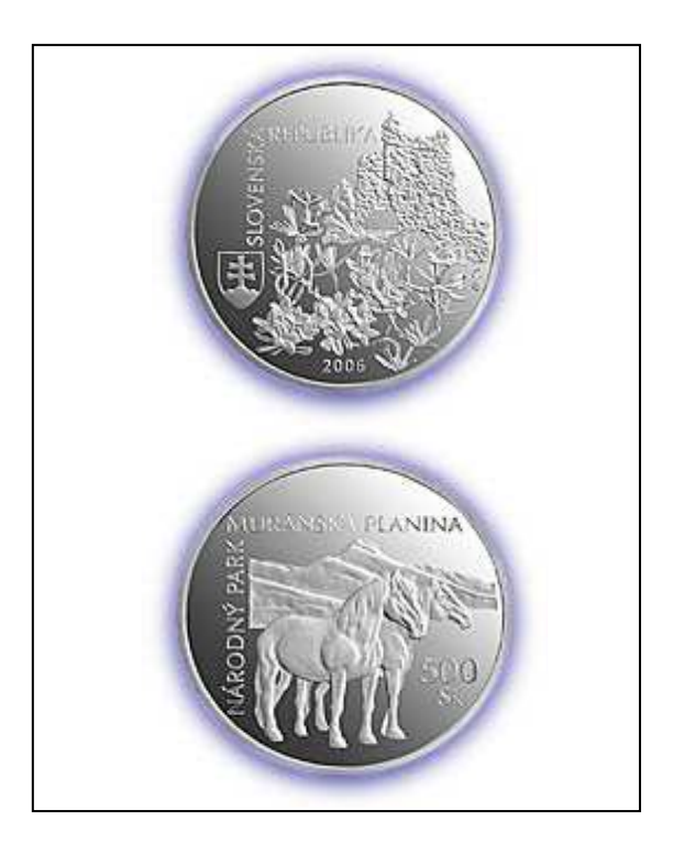
Fig. 7 Obverse and reverse of the Muránska planina NP silver commemorative coin