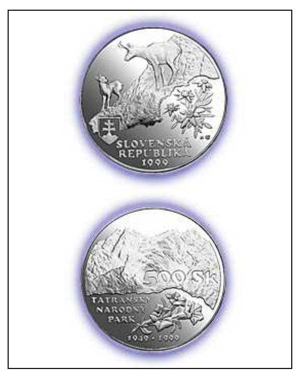
Fig. 4 Obverse and reverse of the Tatra NP silver commemorative coin