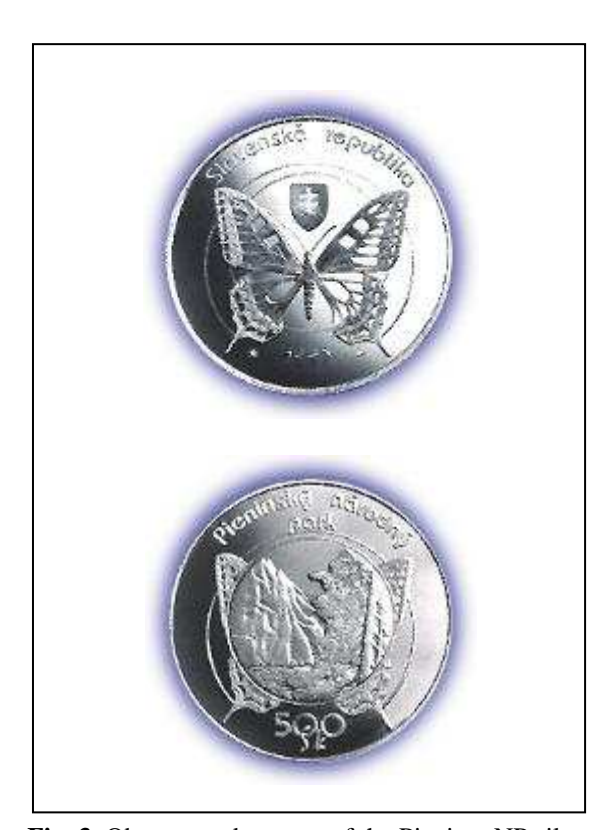
Fig. 3 Obverse and reverse of the Pieniny NP silver collectors coin

The author of coin design is Mgr. Art. Patrik Kovačovský, the engraver of coin is Dalibor Schmidt. Coin producer is the Kremnica Mint, basic parameters of coin are as follows: weight 33,63 g, diameter 40 mm, material Ag 925/1000 Cu 75/1000.