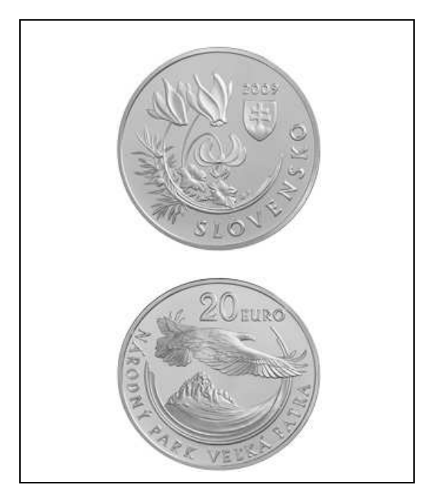
Fig. 9 Obverse and reverse of the Veľká Fatra NP silver collectors' coin

Silver collectors' (numismatic) coin with denomination of 20 € devoted to nature and landscape protection - Veľká Fatra NP was minted by NBS in 2009 (see Fig. 9).