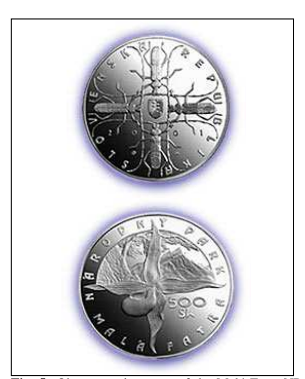
Fig. 5 Obverse and reverse of the Malá Fatra NP silver commemorative coin

Silver commemorative coin with denomination of 500 Sk devoted to nature and landscape protection - Slovak Karst NP was minted by NBS in 2005 (see Fig. 6). The author of coin design is Mária