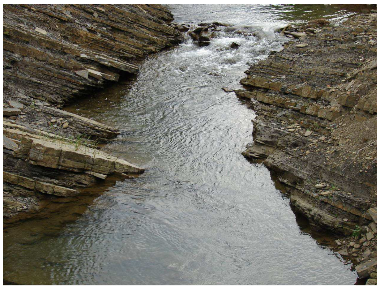
Fig. 1 Sandstones in the valley of Jakubianka river, Photo by: Author

trough Šemberovka, Bedňarovku, Jankovec to Levoča. It was built right after the year 1825 when St. Probstner gained the settlements Nová Ľubovňa a Jakubany. By connecting Levoča with Stará Ľubovňa, trough the mointain pass at Mníšek nad Popradom directing to Halíč, Probstner connected the two lower parts of the area. Now, the road is abandoned and it is called Probstner's historical road. While most of its parts are devastated the road's direction can be clearly identified by the preserved bases of the rest houses along the road to and Jakubany (Fig. 3) [6]. With Levoča the activities of St. Probstner is also connected the classicistic curia in Jakubany built in the 19. century (Fig. 3). The curia was served for the Probstner family for more then one century. At the present, there is no considerable public attention on the preserving of this historical building and it is used as a public school of Jakubany [6].