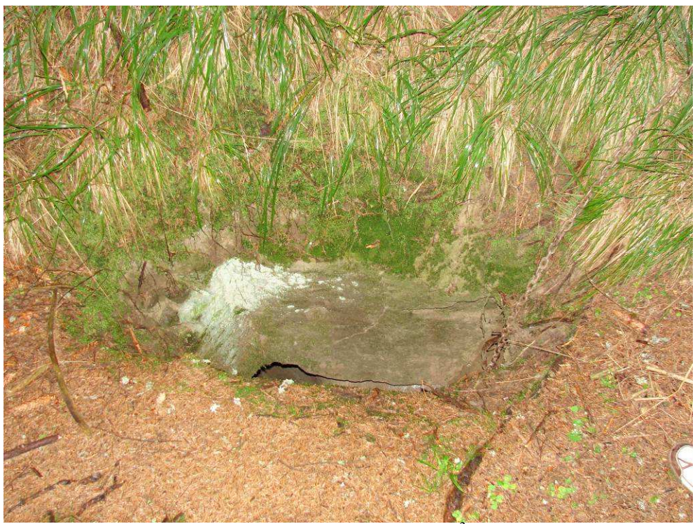
Fig. 3 Unknown hole (size of the leak is about 4 m<sup>2</sup>)