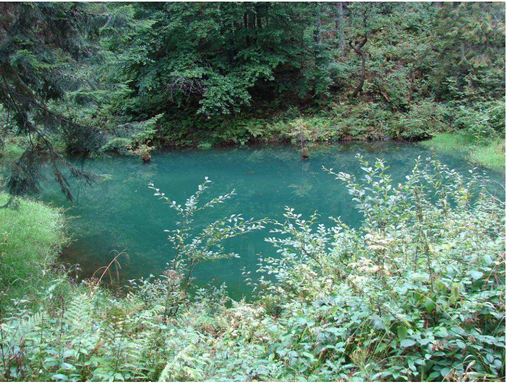
Fig. 2 Unknown lake, Photo by: Author